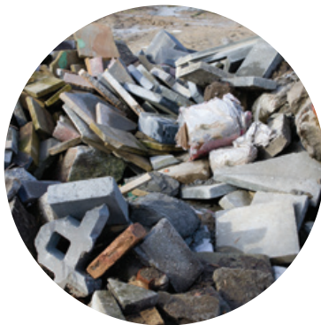
MIXED CONSTRUCTION AND DEMOLITION WASTE