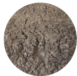
NON DESTRUCTIVE DIGGING