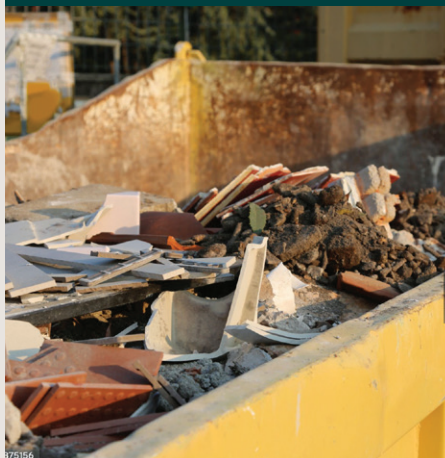
MEDIUM MIXED RECYCLING